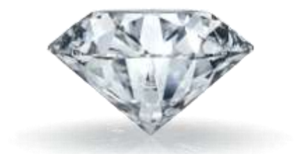
M/s Ankit Gems Pvt. Ltd.